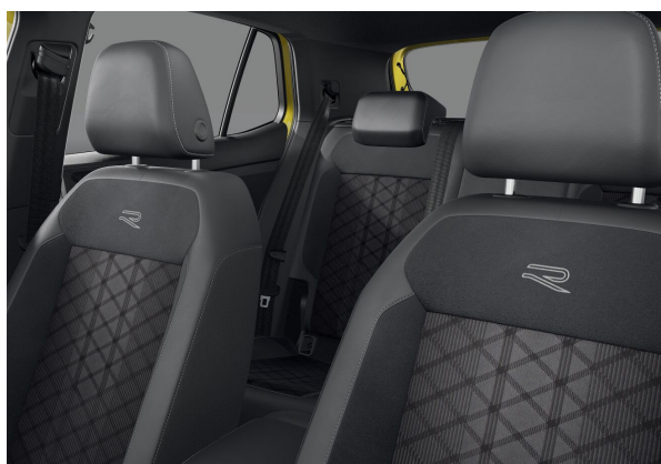
Gray - Titanium Black (WG) Standard on R-Line