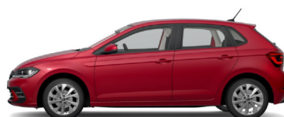
Kings Red Metallic*