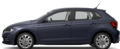
Smoke Grey Metallic*