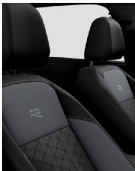
"Karoso" ArtVelours Titan Black (WS) Standard on R-Line & R-Line 75

* Optional at extra cost. Please note, the print processes do not allow exact reproduction of the upholstery colours.