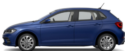
Reef Blue Metallic*