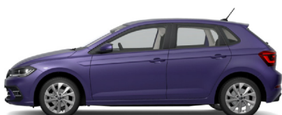
Vibrant Violet Metallic*