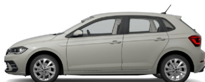
Ascot Grey Solid